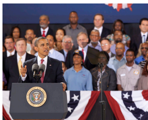
Obama campaigns in Virginia Beach next week