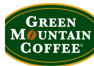
800 new Green Mountain Coffee jobs coming to Isle of Wight